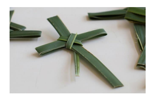
Ash Wednesday - Palm Crosses.

Ash Wednesday 14th February marks the beginning of the Season of Lent. This is a Season of penance, contrition, reflection and fasting, a period of 40 days for us to prepare for Christ's Resurrection on Easter Sunday. During this preparation, we are reminded, that God is gracious and merciful to those who call on Him with repentant hearts.