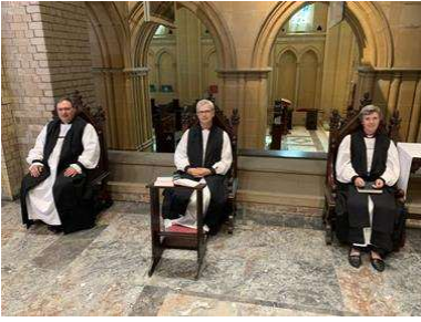
Our bishops in the Cathedral