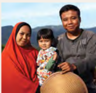
Christmas Bowl 2024 First Sunday of Advent

Through Christ the Hope of the world. Amen.